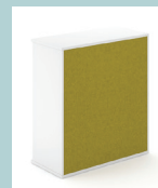
Fabric back panel for specified cabinets