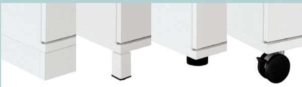
Plinth, metal legs, plastic legs or castors