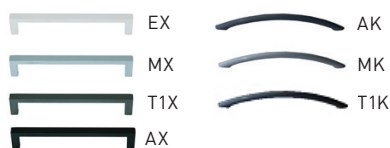
Handle type (colour + handle code)