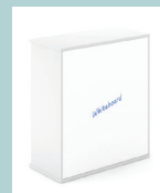
Whiteboard for specified cabinets